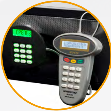
Emergency Handheld Override

Concealed behind a magnetic plate, the UL-rated Medeco™ cylinders are customized to each property with a unique pinning code. Unlike skeleton keys, the Medeco™ key cannot be easily copied and additional keys are only available from the manufacturer with proper authority. The lock is virtually pick proof and cannot be bumped.