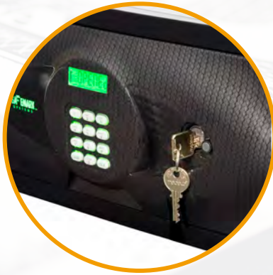
Medeco™ Key Override

Hotels depend on reliable, emergency access to their safes and Safemark's industry-leading override systems deliver confidence. Safemark will undoubtedly meet your security needs while maintaining the design integrity of your guest room.