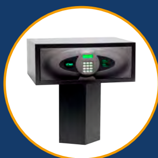
13" Color Matched Pedestals